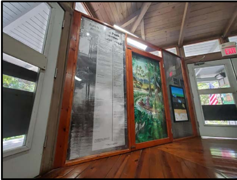
Updated timeline and exhibit at Arch Creek Park

In November, FPAN SE partnered with the Bureau of Land Management at the Jupiter Inlet Lighthouse Outstanding Natural Area to host an Archaeology Merit badge and camping weekend on-site. Over the course of this three-day program, scouts learned about the scientific methodology of archaeology, explored native plant and wildlife habitats, and constructed reproductions of typical south Florida artifacts.